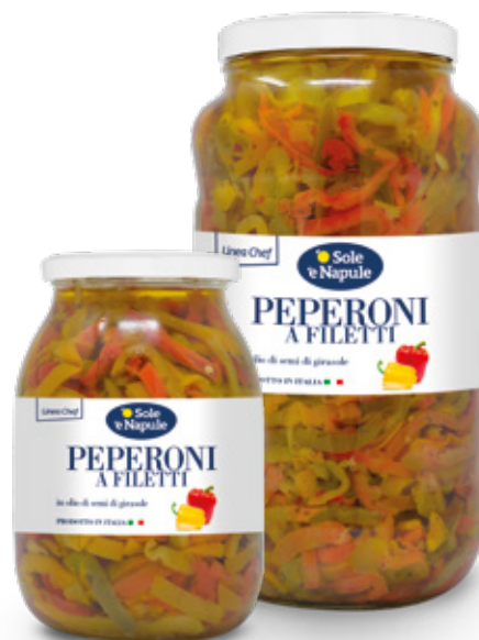
Peperoni a filetti 960g / 2900 g Sliced peppers in sunflower oil 960 g / 2900 g cod. PEPFIL/PEPFIL3 ean: 8014259333668/392