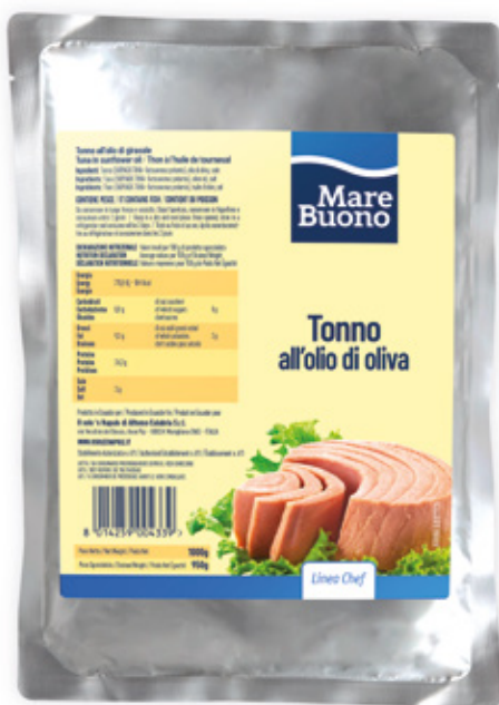
Tonno in busta all'Olio di Oliva 1000g Tuna in olive oil 1000g (aluminium bag)