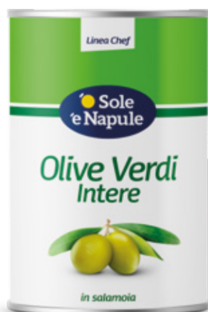
Olive Verdi intere 4100g Whole green olives 28/32 4100g