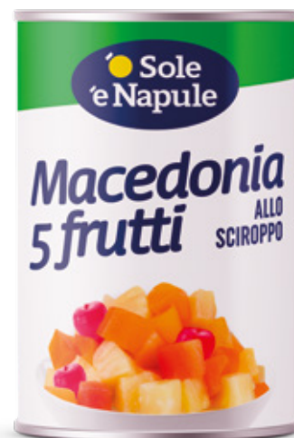
Macedonia 5 frutti allo sciroppo 410g Fruit cocktail in syrup 410g