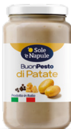
Buonpesto di Patate 190g Pesto of Potatoes 190g