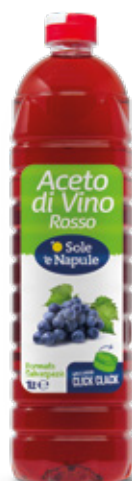
Aceto di vino rosso 1lt Red wine vinegar 1lt