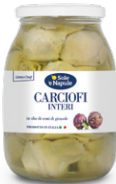
Carciofi interi 960 g Whole Artichokes in sunflower oil 960 g cod. CAROL ean: 8014259333637