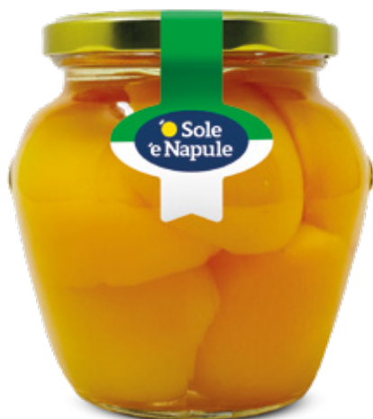
Pesche scioppate 560g Peaches halves in syrup 560g