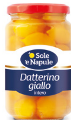
Datterino intero giallo in acqua 360g Whole Yellow Datterino Tomatoes in water 360g