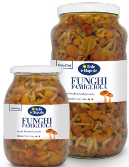
Funghi famigliola 960g / 2900 g Nameko mutabilis mushrooms in sunflower oil 960 g / 2900 g cod. FUNCH- FUNCH3 ean: 8014259333743/507