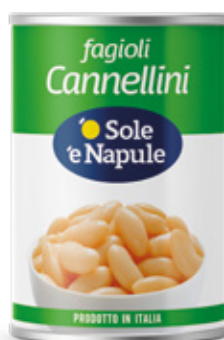
Fagioli Cannellini 400g Cannellini beans 400g cod. CANB ean: 8014259000102