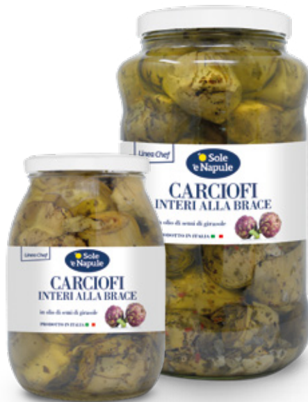
Carciofi interi alla brace 960 g / 2900 g Roasted wholew Artichokes in sunflower oil 960 g- 2900 g cod. CARBRA-CARBRA3 ean: 801459333590/477