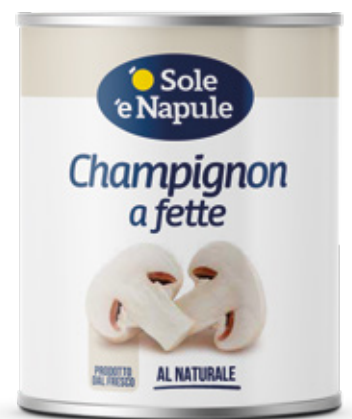
Champignon a fetta 800g Champignon mushrooms 800g