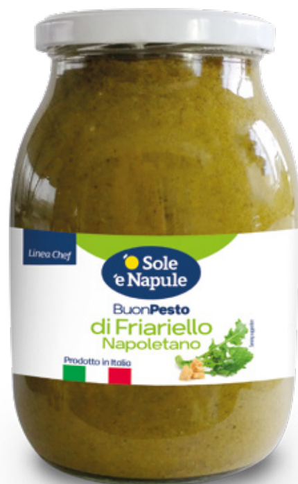
Buonpesto di Friariello Napoletano 970g Pesto of Neapolitan Broccoli 970g cod. PESTFRI1 ean: 8014259001178