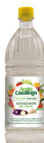
Aceto di Alcol "CASALINGO" Multiuoso 1lt Alcol Vinegar 1lt