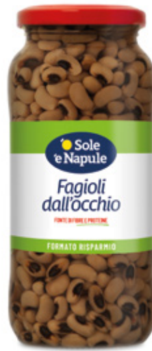
Fagioli dall'occhio 540g Cooked Black Eye Beans 540g cod. OCCVG ean: 8014259001727