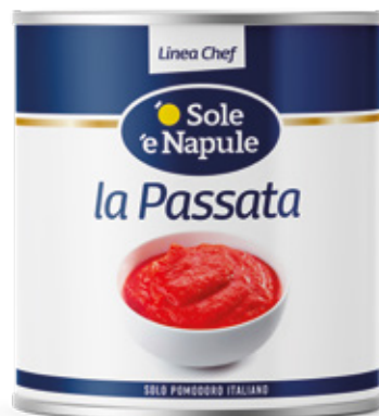
La Passata 2500g Mashed Tomatoes 2500g cod. PAS3 ean: 8014259000157