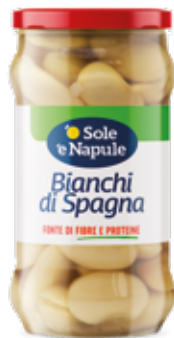
Fagioli Bianchi di Spagna 295g Butter beans 295g cod. CORVPO ean: 8014259001024