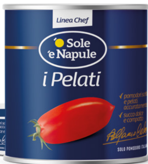
1 Pelati 6x2500g Peeled Tomatoes Signed quality 6x2500g