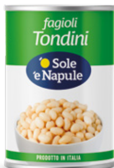
Fagioli Tondini 400g Tondini beans 400g cod. TONB ean: 8014259008207