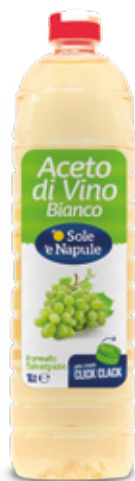
Aceto di vino bianco 1lt White wine vinegar 1lt