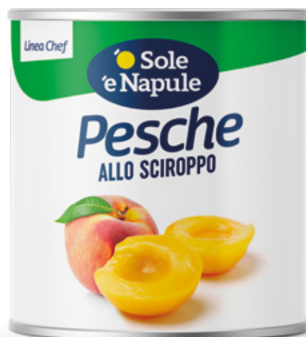
Pesche allo sciroppo 2600 g Peaches halves in syrup 2600 g