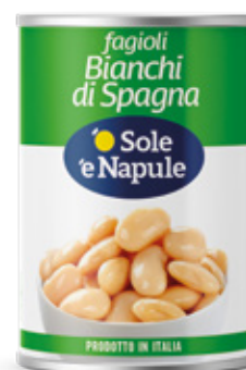
Fagioli bianchi di spagna 400g Butter beans 400g cod. BIAB ean: 8014259000430