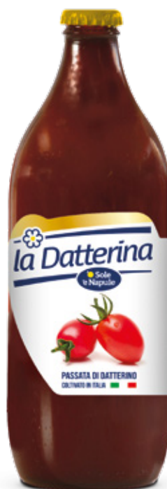
La Datterina 660g Datterina Mashed Datterino Tomatoes 660g