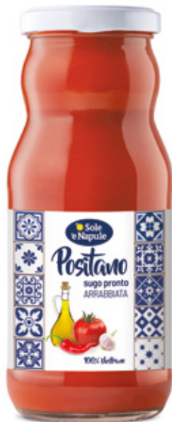
Sugo Pronto Pomodoro e Peperoncino 350g Ready Sauce with Tomato and Chilli Pepper 350g cod. SUGARR ean: 8014259001819