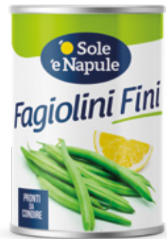
Fagiolini fini 400g Fine string beans 400g