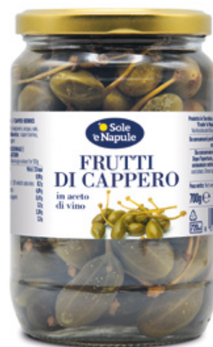
Frutti del Cappero 700 g Caper Berries 700 g