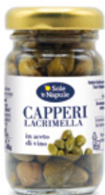
Capperi Lacrimella in aceto di vino 60g Lacrimella Capers in vinegar 60g