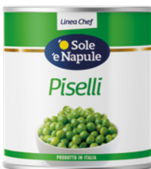
Piselli 2500g Rehydrated peas 2500g cod. PIS3 ean: 8014259000478