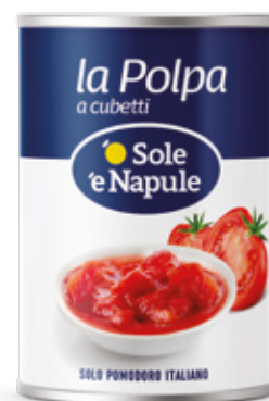
Polpa a Cubetti 400g Chopped Tomatoes 400g