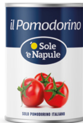
Il Pomodorino 400g Cherry Tomatoes 400g