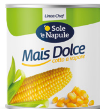
Mais Dolce 1870g Golden sweetcorn 1870g cod. MAIB3 ean: 8014259009037