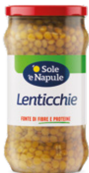
Lenticchie 295g Lentils 295g cod. LENVPO ean: 8014259666698