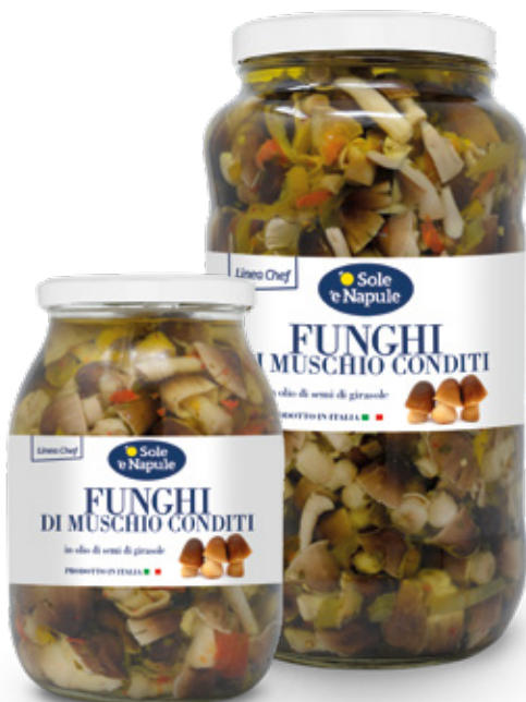
Funghi di muschio conditi 960g / 2900 g Moss mushrooms in sunflower oil 960 g / 2900 g cod. FUNMUS-FUNMUS3 ean: 8014259333750/576