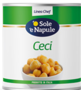
Ceci 2500g Chick peas 2500g cod. CEC3 ean: 8014259753190