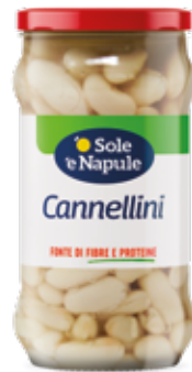
Fagioli Cannellini 295g Cannellini beans 295g cod. CANVPO ean: 8014259001048