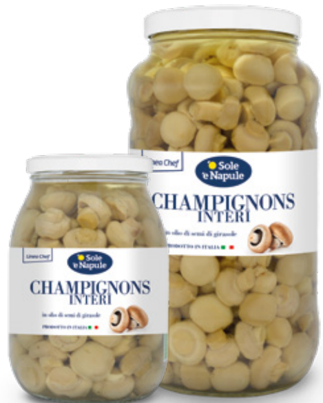
Champignon interi 960g / 2900 g Whole champignon in sunflower oil 960 g / 2900 g cod. FUNINT-FUNINT3 ean: 8014259333736/552