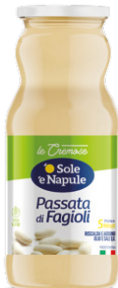
Passata di Fagioli 350g Cannellini beans cream 350g