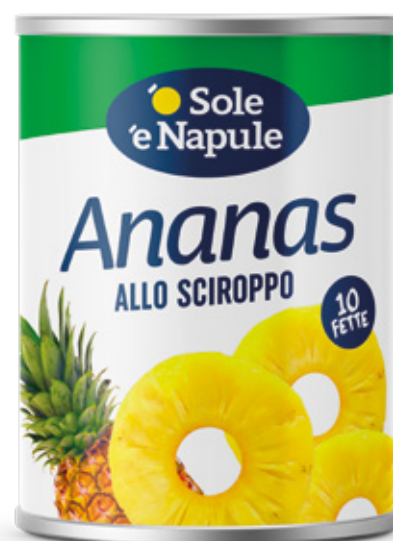
Ananas allo sciroppo 565g Sliced pineapples in syrup 565g