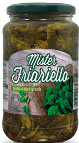
MISTER FRIARIELLO friariello in olio vaso vetro 560gr MISTER FRIARIELLO friariello in olio vaso vetro 560gr