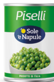
Piselli 400g Rehydrated peas 400g cod. PISB ean: 8014259000201