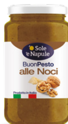
Buonpesto di Noci 190g Pesto of Walnuts 190g