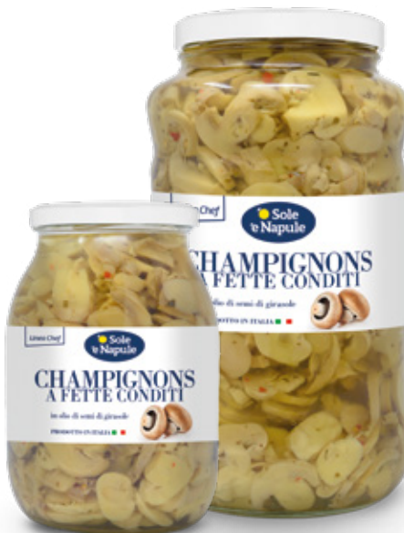
Champignon a fette conditi 960g / 2900 g Sliced champignon in sunflower oil 960 g / 2900 g cod. FUNCON-FUNCON3 ean: 8014259333613/339448