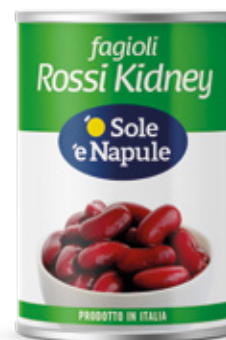
Fagioli Rossi Kidney 400g Red kidney beans 400g cod. FAGR ean: 8014259007088