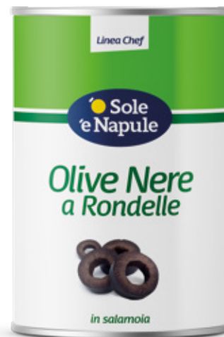
Olive Nere a rondelle 4100g Quarter-inch black olives 4100g