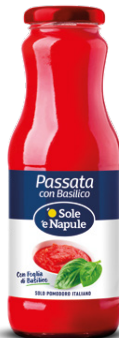
Passata con basilico 680g Mashed Tomatoes with basil 680g