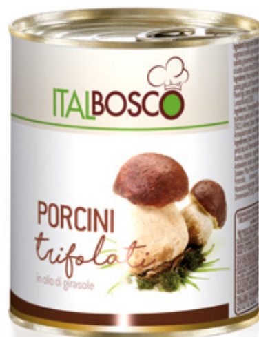
Porcini Trifolati 800g Porcini mushrooms in sunflower oil 800 g cod. PORTRIF ean: 8014259444418