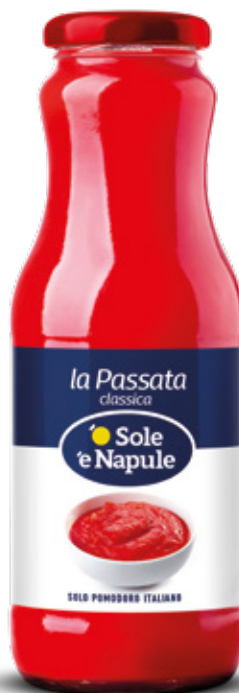
La Passata 680g Classic mashed Tomatoes 680g