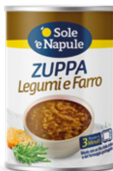
Zuppa legumi e farro 400g Cereal soup with legumes 400g cod. ZUPL ean: 8014259753398