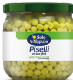
Piselli extra fini 330g Extrafine peas 330g cod. PISP ean: 8014259000393