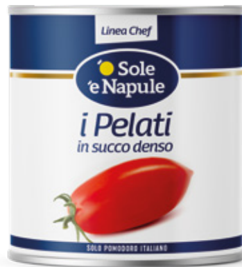
I Pelati 2500g Peeled Tomatoes in tomato juice 2500g cod. PEL3EX ean: 8014259000089