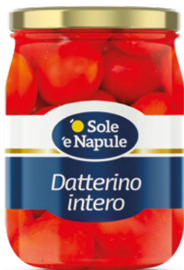
Datterino intero 560g Whole Datterino Tomatoes in water 560g