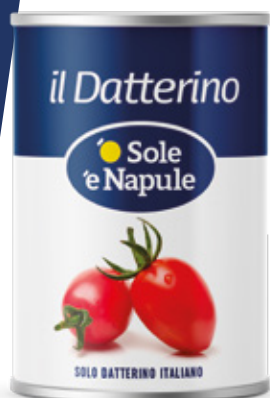
Il Datterino 400g Datterino Tomatoes 400g