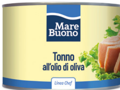
tonno in olio d'oliva latta 1700g Tuna in olive oil 1700g