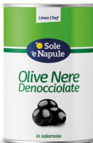
Olive Nere denocciate 4100g Pitted black olives 4100g