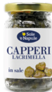
Capperi Lacrimella in sale 90g Lacrimella Capers in salt 90g