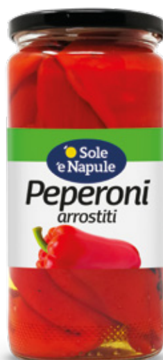
Peperoni arrostiti Vetro 480g Roasted peppers 480g