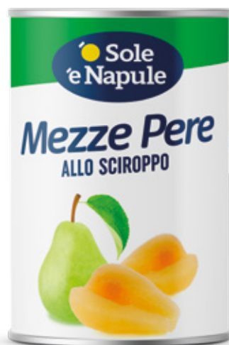
Mezze Pere allo sciroppo 410g Pears halves in syrup 410g