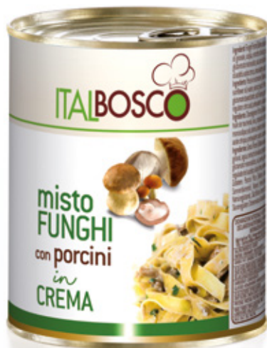
Funghi trifolati in crema 800g Mixed mushrooms with porcini in cream 800 g cod. MISCREM ean: 8014259444425