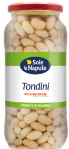
Tondini 540g Tondini Beans 540g cod. TONVG ean: 8014259001543