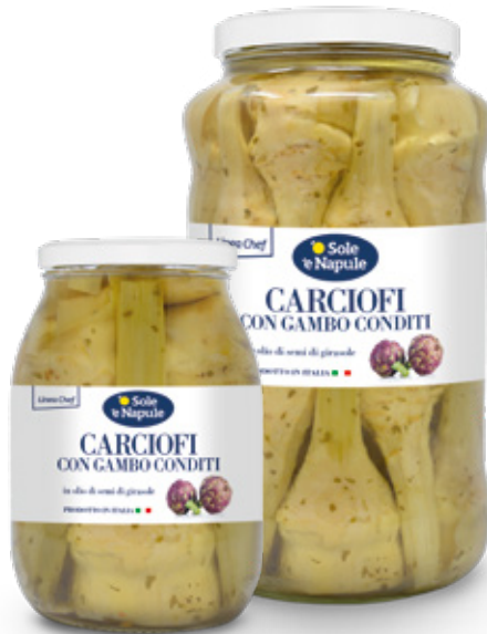
Carciofi con gambo conditi 960g / 2900 g Artichokes with stem in sunflower oil 960 g / 2900 g cod. CARGAM/ CARGAM3 ean: 801425955572/58