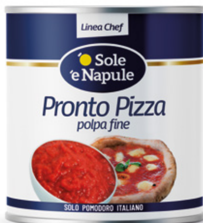
Polpa Pronto Pizza 2,5kg Fine Tomato Pulp 2,5kg cod. CUB ean: 8014259753404