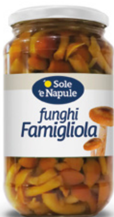
Funghi Famigliola 540g Famigliola mushrooms in water 540g