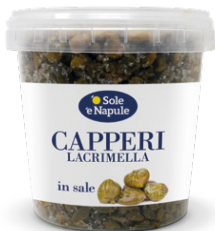
Capperi lacrimella 1000 g Lacrimella Capers in salt 1000 g