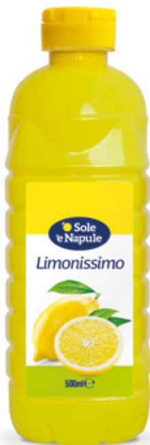
Limonissimo PET - tappo clic clac 500ml Lemon dressing 500ml