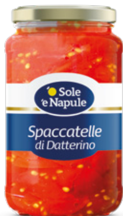
Spaccatelle di Datterino 560g Red half datterino tomatoes 560g