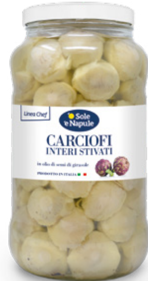
Carciofi interi stivati 2900 g Stowed Artichokes in sunflower oil 2900 g cod. CAROL3ST ean: 8014259333538