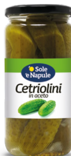
Cetriolo in aceto Vetro 500g Gherkins in brine 500g