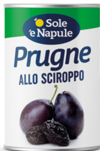
Prugne allo sciroppo 420g Prunes with stones in syrup 420g