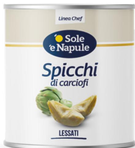
Spicchi di carciofi 2500g Artichokes quartered in brine 2500g cod. CAR3 ean: 8014259222221