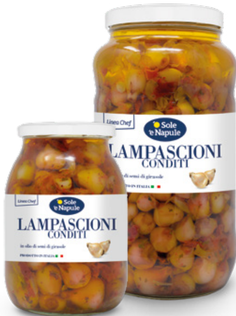
Lampascioni conditi 960g / 2900 g Lampascioni in sunflower oil 960 g / 2900 g cod. LAMPS-LAMP3 ean: 801425955596/466