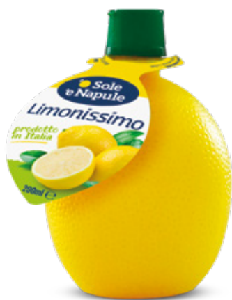
Limonissimo Plastica 200ml Lemon dressing 200ml