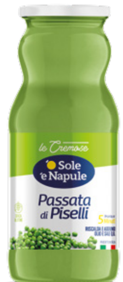
Passata di Piselli 350g Peas cream 350g