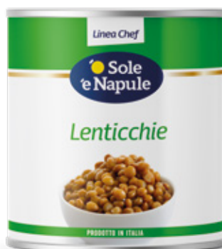
Lenticchie 2500g Lentils 2500g cod. LEN3 ean: 8014259001062