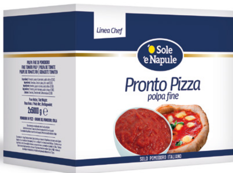
Bag Pronto Pizza 2x5kg Fine Tomato Pulp bag in box 2x5kg cod. CUBS5 ean: 8014259753442