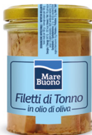
Filetti di Tonno Mare Buono 190g Mare Buono Tuna's Filets in olive oil 190g