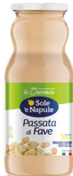
Passata di Fave 350g Fava beans cream 350g