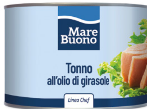
tonno in olio di girasole latta 1700g Tuna in Sunflower oil 1700g