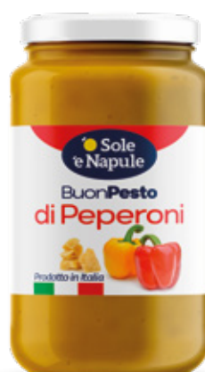
Buonpesto di Peperoni 190g Pesto of Peppers 190g