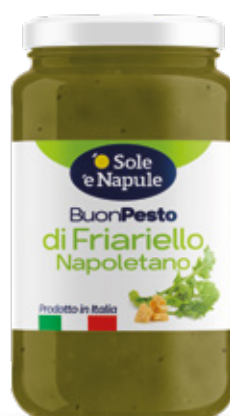
Buonpesto di Friariello Napoletano 190g Pesto of Neapolitan Broccoli 190g