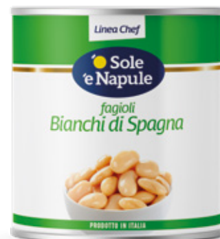
Fagioli Bianchi di Spagna 2500g Butter beans 2500g cod. BIAB3 ean: 8014259008702