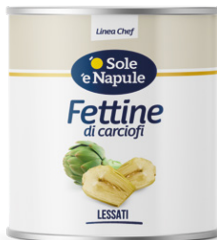
Fettine di carciofi 2500g Sliced artichokes in brine 2500g cod. CARF3 ean: 8014259222238