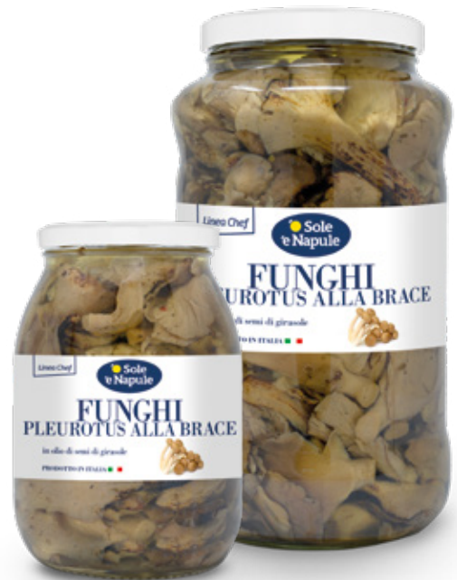
Funghi Pleurotus alla brace 960g / 2900 g Roasted pleurotus mushrooms in sunflower oil 960 g / 2900 g cod. PLEROSTR PLEROSTR3 ean: 8014259333774/514