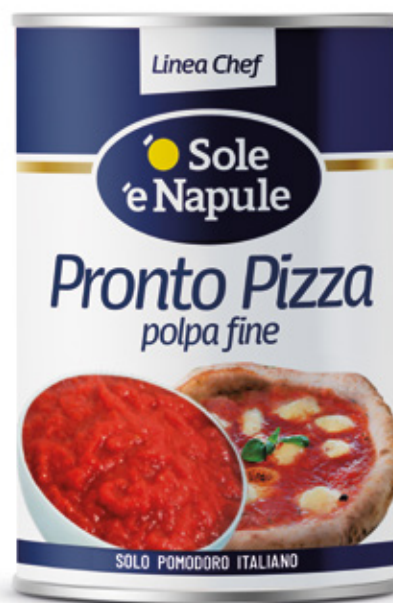
Polpa Pronto Pizza 4,05kg Fine Tomato Pulp 4,05kg cod. CUB5M ean: 8014259753244