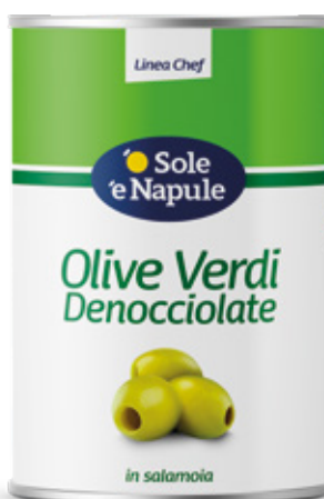
Olive Verdi denocciate 4100g Pitted green olives 4100g