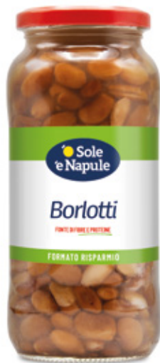
Borlotti 540g Borlotti Beans 540g cod. BORVG ean: 8014259001550