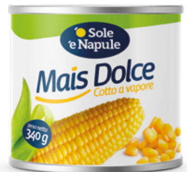
Mais dolce 340g Golden sweetcorn 340g