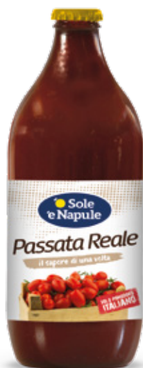
Passata Reale 320g Reale mashed Tomatoes 320g