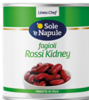
Fagioli Rossi Kidney 2500g Red kidney beans 2500g cod. FAGR3 ean: 8014259000287