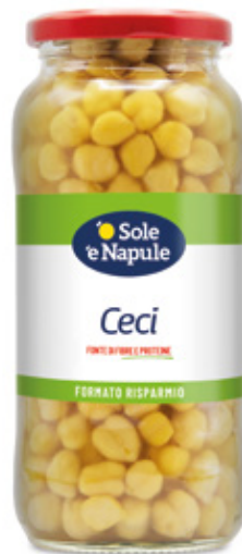
Ceci 540g Chick Peas 540g cod. CECVG ean: 8014259001536