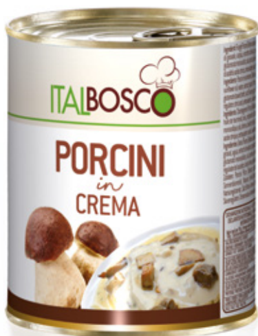
Porcini trifolati in crema 800g Porcini mushrooms in cream 800 g cod. PORCREM ean: 8014259444449