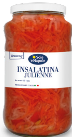
Insalatina Julienne 2900 g Julienne of vegetables in sunflower oil 2900 g cod. JULIENNE3 ean: 8014259000928