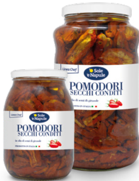
Pomodori secchi conditi 960g / 2900 g Sundried Tomatoes in sunflower oil 960 g / 2900 g cod. POMS/POMS3 ean: 8014259883606/889493