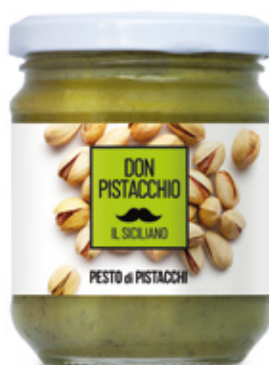
DON PISTACCHIO Pesto di Pistacchio vetro 190g DON PISTACCHIO Pesto of Pistachio 190g