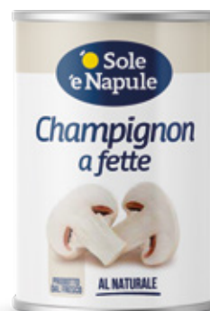
Champignon a fetta 400g Champignon mushrooms 400g