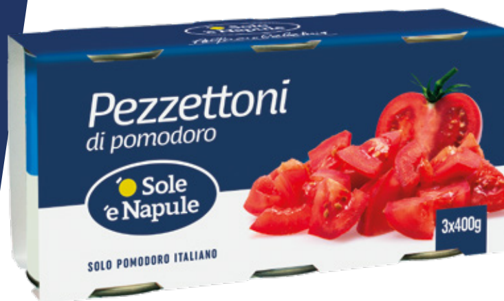
Pezzettoni di Pomodoro 400g Chopped Tomatoes in cluster 3x400g