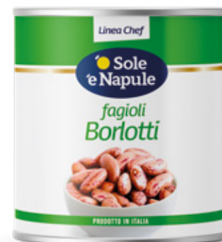
Fagioli Borlotti 2500g Borlotti beans 2500g cod. BOR3 ean: 8014259008801