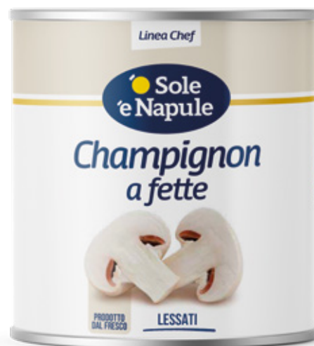
Champignon a fette 2500g Champignon mushrooms 2500g cod. FUNG ean: 8014259753251