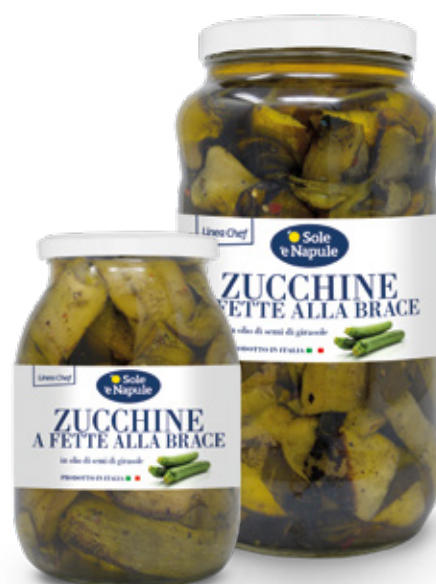
Zucchine a fette alla brace 960g / 2900 g Roasted zucchinis in sunflower oil 960 g / 2900 g cod. ZUCBR/ZUCBR3 ean: 8014259333781/699