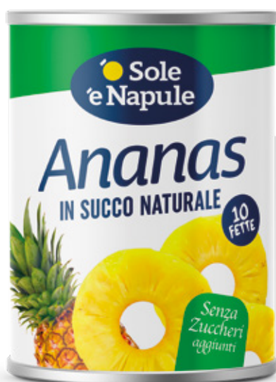
Ananas in succo naturale 565g Sliced pineapples without sugar 565g