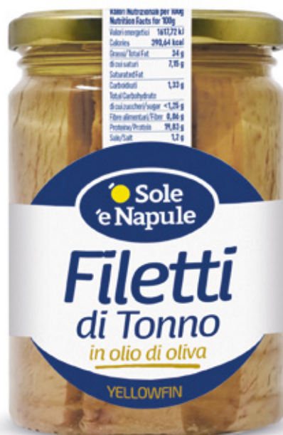
Filetti di Tonno Vetro 445ml Tuna's filets in olive oil 445ml