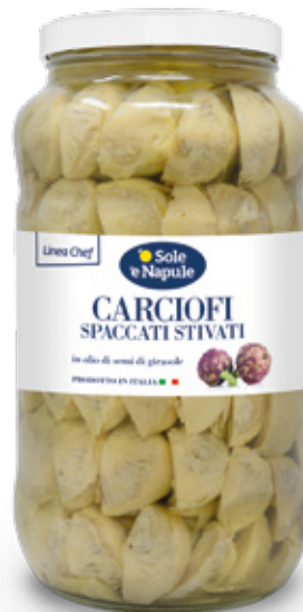
Carciofi spaccati stivati 2900 g Quartered stowed artichokes in sunflower oil 2900 g cod. CARSPAC3 ean: 8014259333705