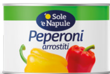
Peperoni arrostiti Latta 425g Roasted peppers in brine 425g