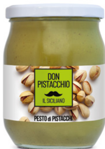
DON PISTACCHIO Pesto di Pistacchio vetro 560g DON PISTACCHIO Pesto of Pistachio 560g cod. PIST560 ean: 8014259001086