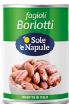
Fagioli Borlotti 400g Borlotti beans 400g cod. BORB ean: 8014259000164