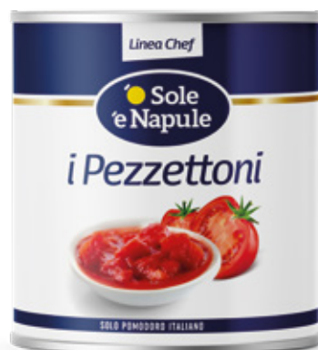
I Pezzettoni 2500g Chopped Tomatoes 2500g cod. POL3 ean: 8014259000492