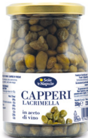
Capperi Lacrimella in aceto di vino 350g Lacrimella Capers in vinegar 350g