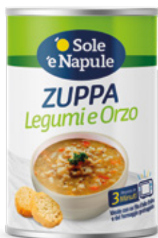
Zuppa legumi e orzo 400g Cereal and legumes soup with barley 400g cod. ZUPOR ean: 8014259000096