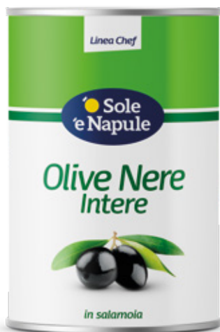
Olive Nere intere 4100g Whole black olives 28/32 4100g