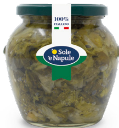
Scarola con olive e capperi Vetro 520g Neapolitan lettuce with olives and capers 520g