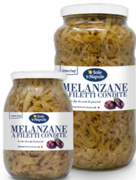
Melanzane a filetti condite 960g / 2900 g Sliced eggplants in sunflower oil 960 g / 2900 g cod. MELFI/MELFI3 ean: 8014259333576/439