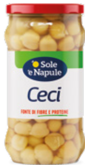
Ceci 295g Chick peas 295g cod. CECVPO ean: 8014259001031