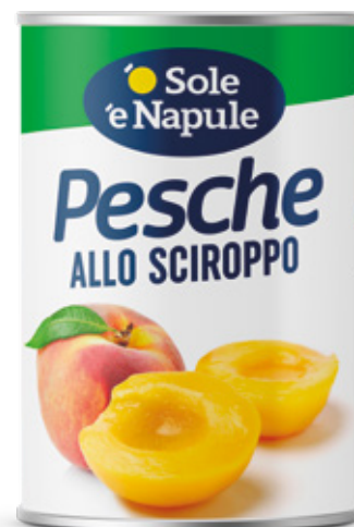
Pesche allo sciroppo 410g Peaches halves in syrup 410g