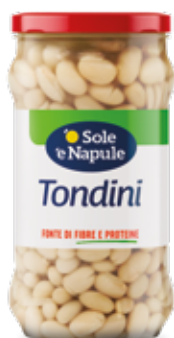
Fagioli Tondini 295g Tondini beans 295g cod. TONVPO ean: 8014259001055