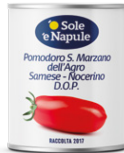
Pomodoro San Marzano 800g San Marzano Peeled Tomatoes 800g cod. SMAD0P1 ean: 8014259000355