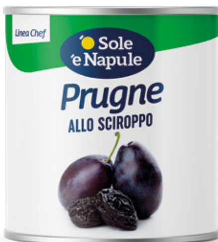
Prugne allo sciroppo 2600 g Prunes with stones in syrup 2600 g