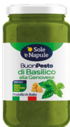
Buonpesto di basilico alla Genovese 190g Pesto of Genovese Basil 190g