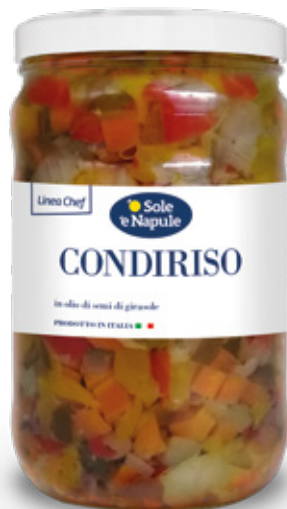
Condiriso 1600 g Mixed vegetables for rice in sunflower oil 1600 g cod. CONDI17 ean: 8014259000942