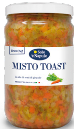
Misto Toast 1600 g Mixed toast in sunflower oil 1600 g cod. MISTOS17 ean: 8014259555428