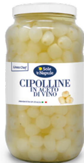
Cipolline in aceto di vino 2900 g Onions in vinegar 2900 g cod. CIPACE3 ean: 8014259555445