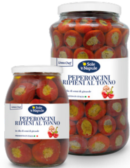
Peperoncini ripieni al tonno 960g / 2900 g Peppers with tuna in sunflower oil 960 g / 2900 g cod. PEPTON/PEPTON3 ean: 8014259333682/521