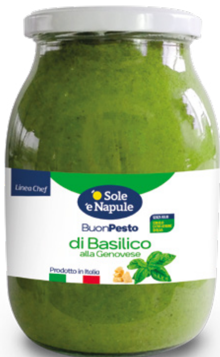
Buonpesto di Basilico alla Genovese 970g Pesto of Genovese Basil 970g cod. PESTGEN1 ean: 8014259001192