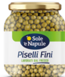
Piselli 360g Fine peas 360g cod. PISF ean: 8014259000300