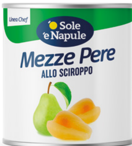
Mezze pere allo sciroppo 2600 g Pears halves in syrup 2600 g