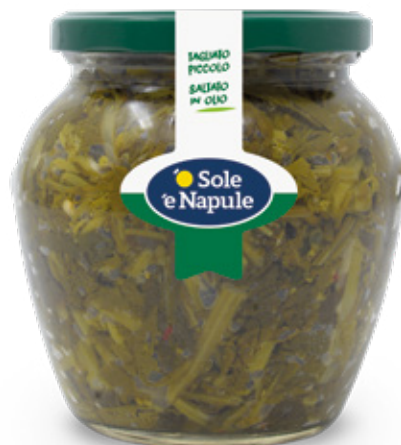
Friariello Napoletano Vetro 520g Friarielli Neapolitan broccoli in oil 520g