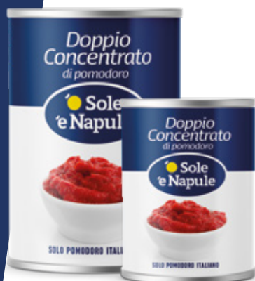
Doppio Concentrato 400g | 140g Tomato Paste 28/30 400g | 140g

cod. CON500-CON200 ean: 8014259000454/447