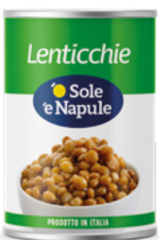
Lenticchie 400g Lentils 400g cod. LENB ean: 8014259000195