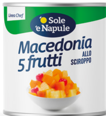
Macedonia 5 frutti allo sciroppo 2600 g Fruit cocktail in syrup 2600 g