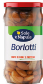
Fagioli Borlotti 295g Borlotti beans 295g cod. BORVPO ean: 8014259001017