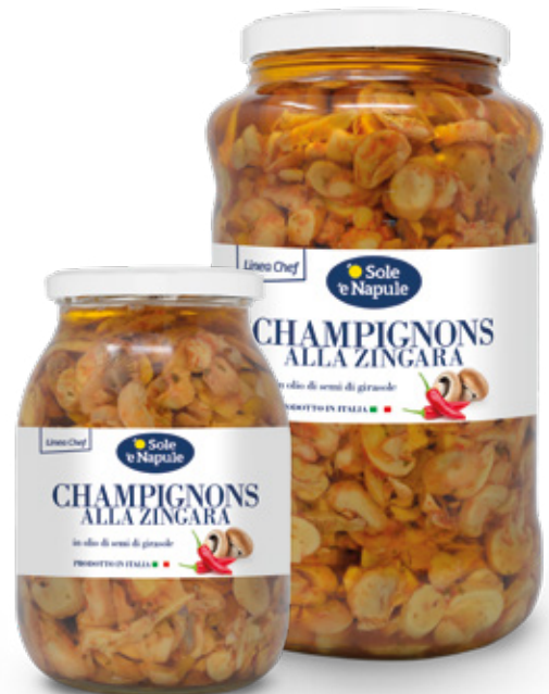
Champignon alla zingara 960g / 2900 g Champignon "Zingara" seasoned in sunflower oil 960 g / 2900 g cod. FUNCONZI-FUNCONZI3 ean: 8014259333620/339545