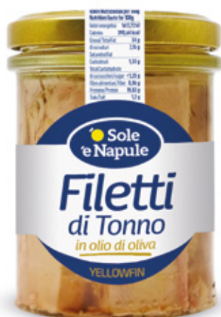
Filetti di Tonno Vetro 212ml Tuna's filets in olive oil 212ml