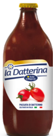
La Datterina 320g Datterina Mashed Datterino Tomatoes 320g