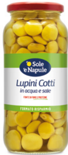
Lupini Cotti in Acqua e Sale 540g Cooked Lupin 540g cod. LUPVG ean: 8014259001734