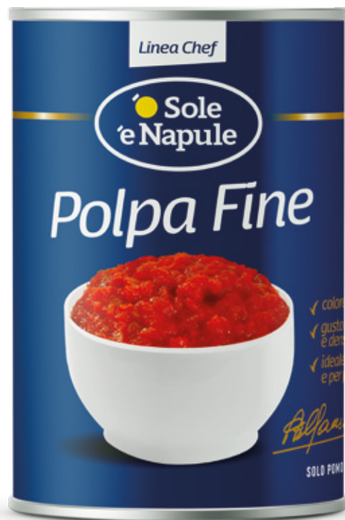
Polpa Fine 4100g Fine Tomato Pulp "Signed" quality 4100g cod. CUB5MCA ean: 8014259004230