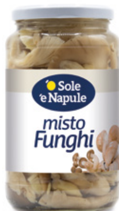
Misto Funghi al naturale 540g Mixed Mushrooms 540g