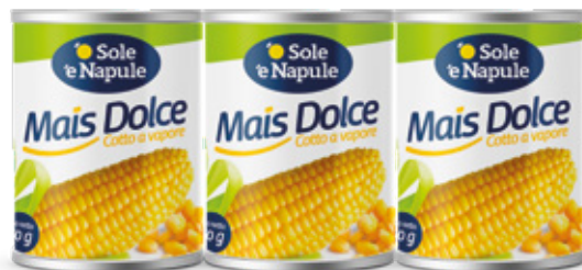
Mais dolce 3x150g Golden sweetcorn (tris) 3x150g