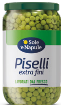
Piselli extra fini 660g Extrafine peas 660g cod. PISGM6 ean: 8014259000218