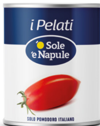
i Pelati 800g Peeled Tomatoes 800g

cod. CON500-CON200 ean: 8014259000454/447