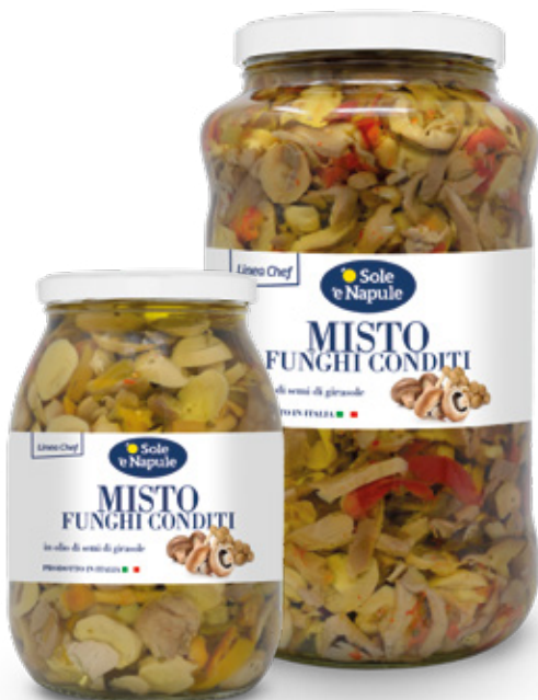
Misto funghi conditi 960g / 2900 g Mixed mushrooms in sunflower oil 960 g / 2900 g cod. FUNTRI-FUNTRI3 ean: 8014259333644/484