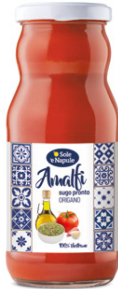
Sugo Pronto Pomodoro e Origano 350g Ready Sauce with Tomato and Oregan 350g cod. SUGMAR ean: 8014259001918