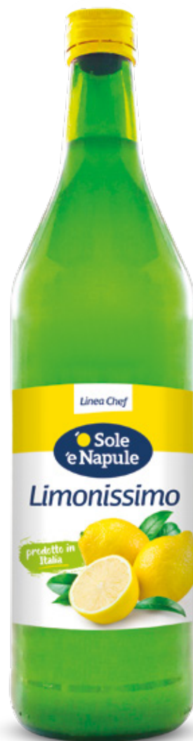
Limonissimo Vetro 1lt Lemon dressing 1lt