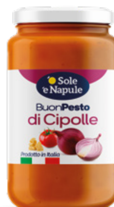
Buonpesto di Cipolle 190g Pesto of Onions 190g