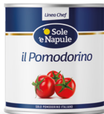
Il Pomodorino 2500g Cherry Tomatoes 2500g cod. POM3 ean: 8014259000294