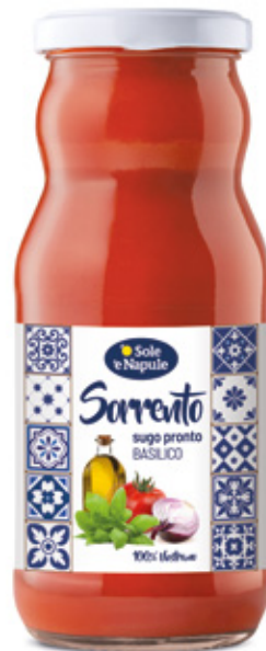
Sugo Pronto Pomodoro e Basilico 350g Ready Sauce with Tomato and Basil 350g cod. SUGBAS ean: 8014259001710