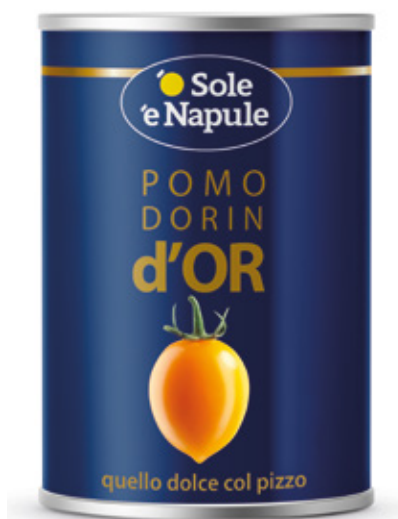
Pomodori d'Or 400g Yellow Cherry Tomatoes 400g