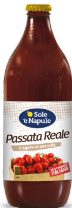
Passata Reale 660g Reale mashed Tomatoes 660g