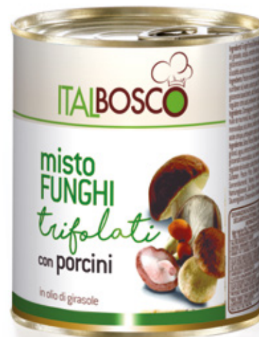
Funghi trifolati 800g Mixed mushrooms with porcini in sunflower oil 800 g cod. MISTRIF ean: 8014259444432