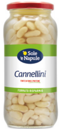
Fagioli Cannellini 540g Cannellini Beans 540g cod. CANVG ean: 8014259001529