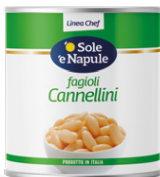
Fagioli Cannellini 2500g Cannellini beans 2500g cod. CAN3 ean: 8014259008900