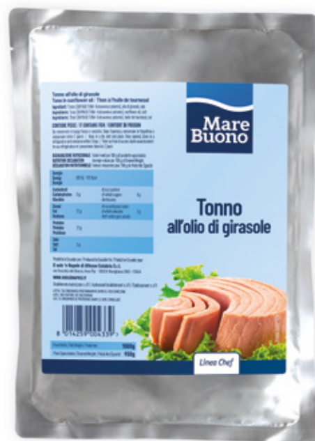
Tonno in busta all'olio di Girasole 1000g Tuna in Sunflower oil 1000g (aluminium bag)