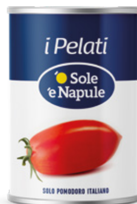
i Pelati 400g Peeled Tomatoes 400g