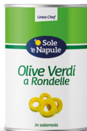
Olive Verdi a rondelle 4100g Quarter-inch green olives 4100g