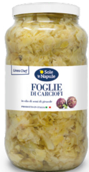
Foglie di carciofi 2900 g Artichokes leaves in oil 2900 g cod. CARF0G3 ean: 8014259333453