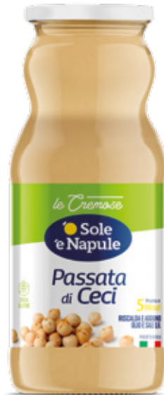
Passata di Ceci 350g Chick peas cream 350g