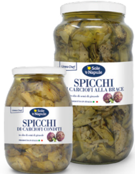
Spicchi di carciofi conditi alla brace 960 g / 2900 g Quartered roasted artichokes in sunflower oil 960 g - 2900 g cod. SPICARBRA/SPICARBRA3 ean: 8014259333675/729