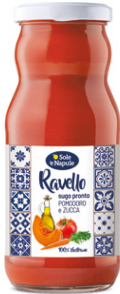
Sugo Pronto Pomodoro e Zucca 350g Ready Sauce with Tomato and Pumpkin 350g cod. SUGPOZU ean: 8014259001611