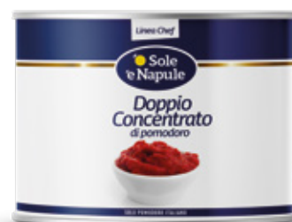
Doppio Concentrato 2200g Tomato paste 2200g cod. CON3 ean: 8014259753237