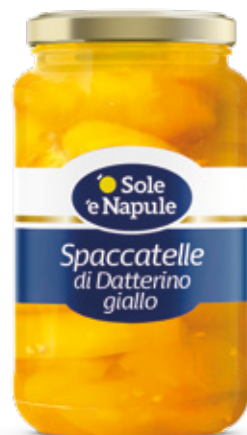
Spaccatelle di Datterino giallo 560g Yellow half datterino tomatoes 560g