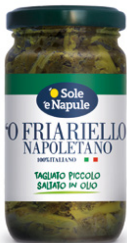
Friariello Napoletano in olio 190g Friarielli Neapolitan Broccoli in oil 190g