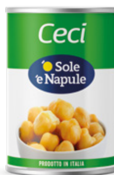
Ceci 400g Chick peas 400g cod. CECB ean: 8014259000188