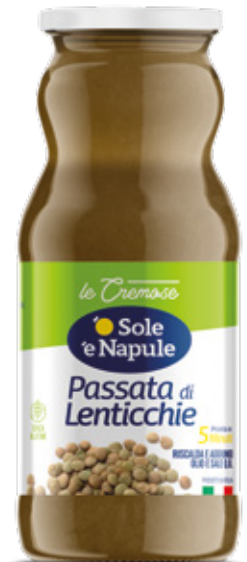
Passata di Lenticchie 350g Lentils cream 350g