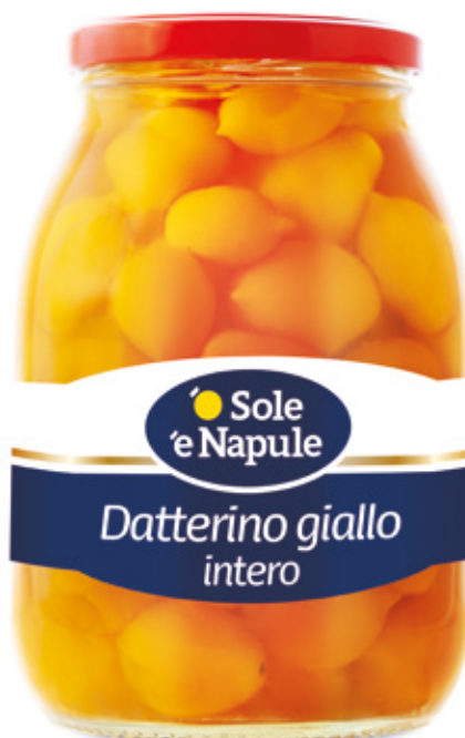
Datterino giallo intero in acqua 990g Whole Yellow Datterino Tomatoes in water 990g