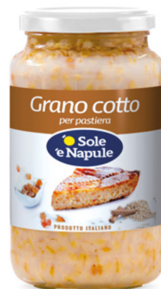
Grano cotto per Pastiera 580g Pre-cooked wheat 580g