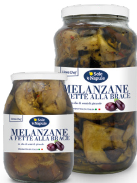
Melanzane a fette alla brace 960g / 2900 g Roasted eggplants in sunflower oil 960 g / 2900 g cod. MELBR/MELBR3 ean: 8014259333651/460